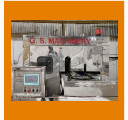
Automatic Blow Molding Machine