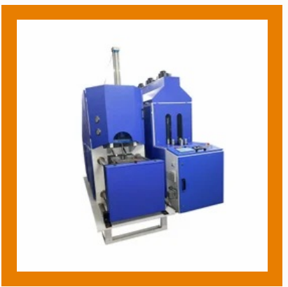
20 Itrs Jar Semi Automatic Pet Blow Molding Machine