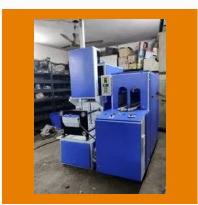
Pharma Bottle Pet Blow Machine