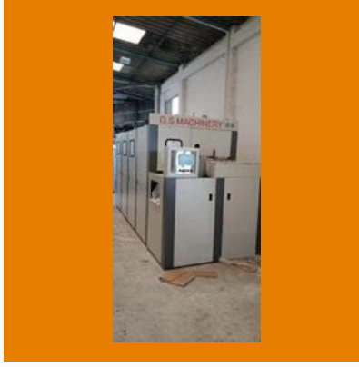
6 cavity Fully Automatic handfeed Pet Bottle Making Machine