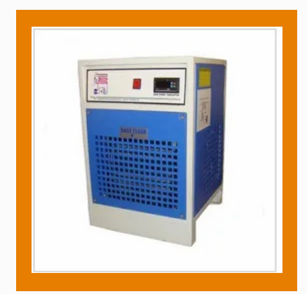
Hot Air Dryer