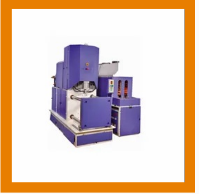
PP Blow Moulding Machine