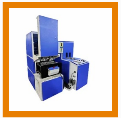
4 Cavity Plastic Bottle Making Machine