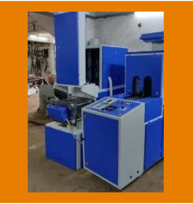
Autodrop Pet Blowing Machines