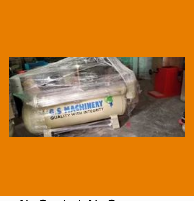
Air Cooled Air Compressor