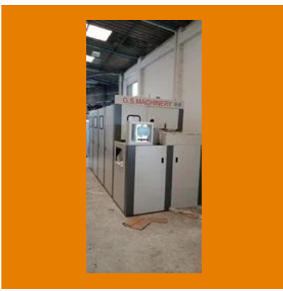
2 Cavity Handfeed Water Bottle Making Machine