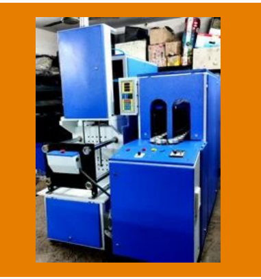
Pet jar Blowing machine