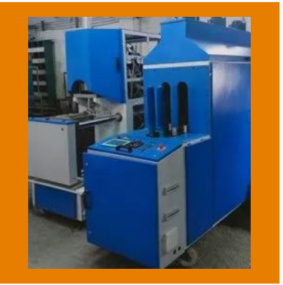
10 Ltr - 20 Ltr Water Jar & Dispenser Making Machine With Single Cavity (100-250) Bph