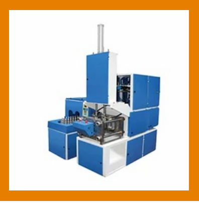
Pet Bottle Blowing Machine Auto Drop