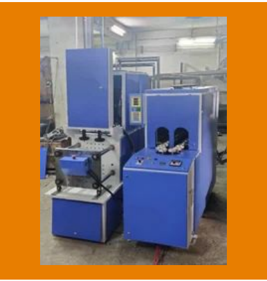
PET Stretch Blowing Machine