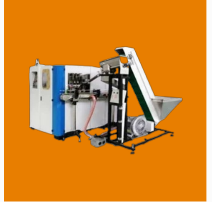
Automatic PET Blow Molding Machine