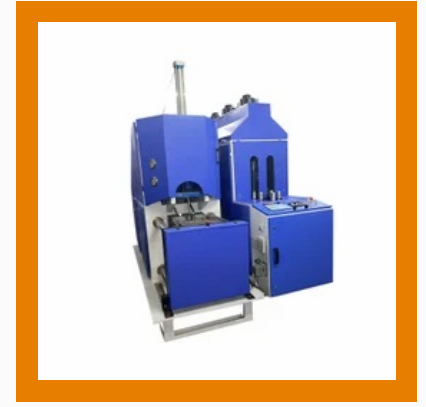
8to 20 Itr Pet Jar Stretch Blow Moulding Machine