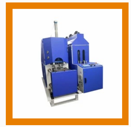
20 Itrs Jar Semi Automatic Pet Blow Molding Machine