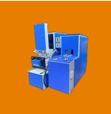
Fridge Bottles Making Machines