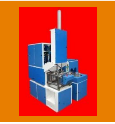
PET Blowing Machine