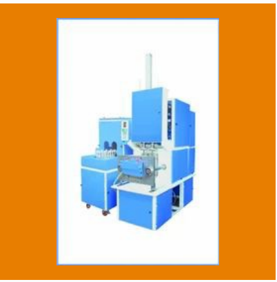
PET Bottle Making Machines