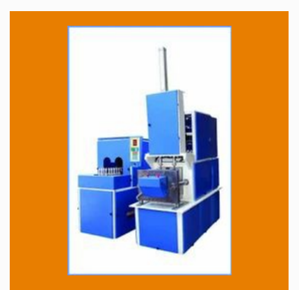
Pet Bottle Making Machine