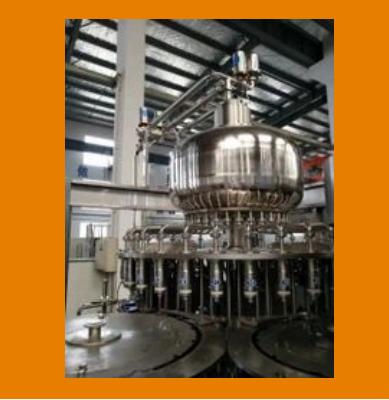
Automatic Mineral Water Bottle Filling Machine