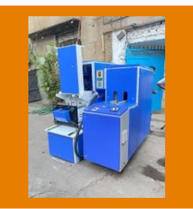
Plastic Jar Making Machine