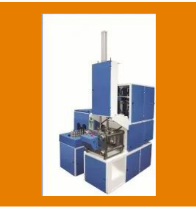
2 cavity Pet Blowing Machine