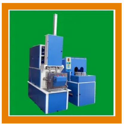
Bottle Jar Machine